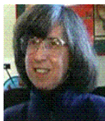
Joan Gregory Eccles Health Sciences Library

"It's greatest value is that it is integrated into UAF's "holistic" approach to providing high quality information to individuals diagnosed with HIV/AIDS.