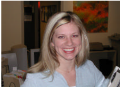
Karidee gearing up for testing